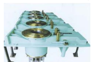
Round Mould Assembly