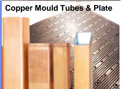
Copper Mould Tubes & Plate