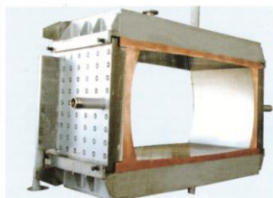
Electrolag Mould Assembly